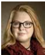
Rigmor Dam (C)