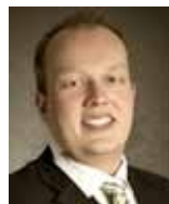
Reimund Langgaard (B)